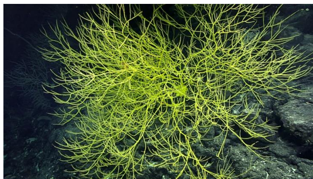
Image 3. A giant bamboo coral nearly as big as a Remote Operated Vehicle on the Kahalewai seamount at close to 1,700m deep.

Ocean oxygen concentrations will decrease by as much as 0.03 mL L -1 by 2100, a 3.7% or more decrease (26). In waters 200-3000m deep, atmospheric carbon dioxide uptake will decrease ocean pH by approximately 0.3 units by 2100 (26). All of these changes represent large alterations in the formerly rather stable ocean environment. Together, ocean warming, acidification, and oxygen loss profoundly affect marine species. Already they are causing marine species to move poleward (27). Vertical stratification is increasing, ultimately altering the amount and timing of phytoplankton production and thus fundamentally changing the magnitude and seasonality of food production supporting the ocean food web (27). Biological recycling and export of organic carbon to the deep ocean are expected to change, as will microbial cycling of elements (27). The impacts of climate change on deep sea ecosystems are not well understood, but it is likely that changing temperature, oxygen, or pH will stress deep sea life. The addition of DSM-related disruptions to existing climate stress could be too much for deep sea species to tolerate, but this is currently very poorly understood.