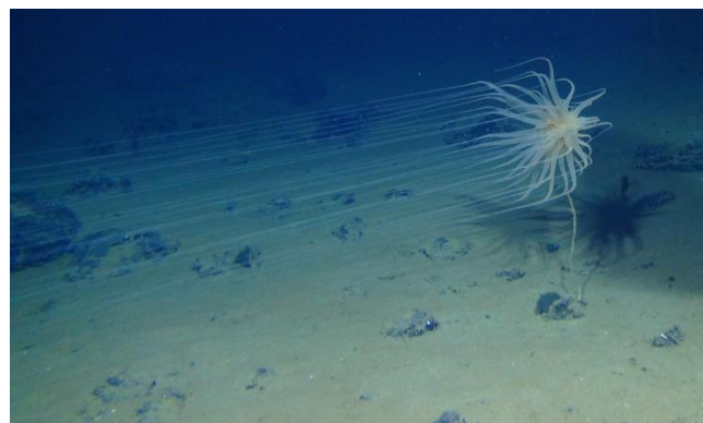
Image 1. A cnidarian that lives on sponge stalks attached to polymetallic nodules, collected at 4,100m in the Clarion-Clipperton Fracture Zone (CCZ).

Deep sea habitats where critical elements are found, like seamounts (underwater mountains), hydrothermal vents, cobalt rich crusts, and metallic nodules, host unique species that can only live in the extreme conditions found around those locations (5). For instance, microbes hosted by tubeworms or crabs living near hydrothermal vents or growing in mats on mineral substrates are primary producers that depend on hydrothermal vent fluids for energy (6), and they sustain a wide variety of predatory deep-sea species. Polymetallic/ferromanganese nodules provide important habitats for microbes that generate food from chemical sources and provide a major food source for other seafloor species (7). Other bottom-dwelling organisms attach to the hard substrate provided by nodules. Richly diverse deep sea ecosystems arise from these improbable starting conditions, yet these ecosystems are still not well understood.