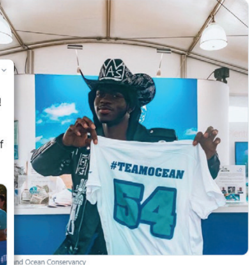
n 31. 2020 from Miami, FL - Twitter for iPhone

Thanks for always standing up for our ocean, @LilNasX!