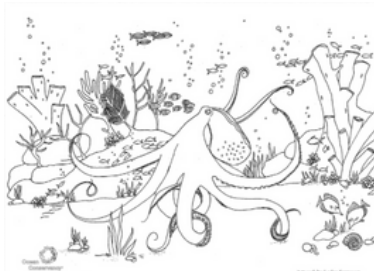
FISH COLORING PAGES