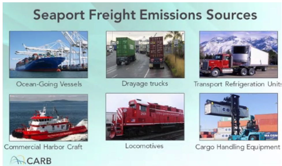
Figure 2: Seaport Freight Emissions Sources