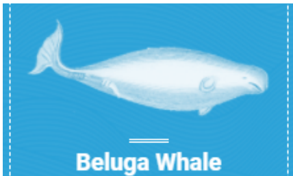
WILDLIFE FACT SHEETS

Looking for more ways to engage your friends and family? We have compiled some resources here that you can download and/or print to incorporate into your fundraiser.