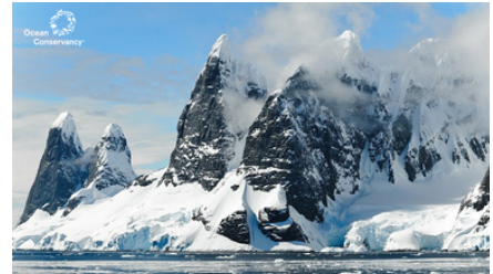
OCEAN CONSERVANCY PHOTOS