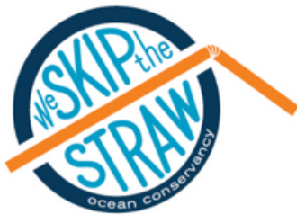
SKIP THE STRAW RESOURCES