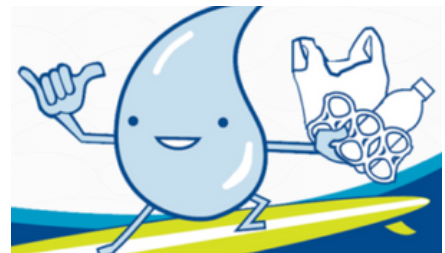
TALKING TRASH AND TAKING ACTION EDUCATIONAL MATERIALS