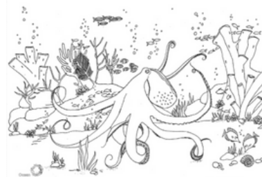
FISH COLORING PAGES